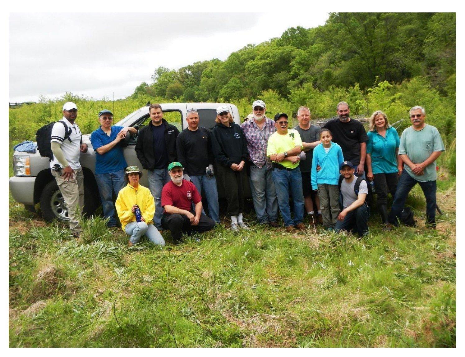
The group at Reddy Branch